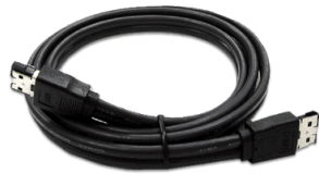
eSATA Cable x2